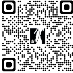
HOOK Finish Report

Scan or click the below QR codes for direct access to each of the 2025 HOOK resources.