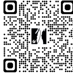
HOOK Withdrawal Report