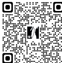
Getting Back from the HOOK