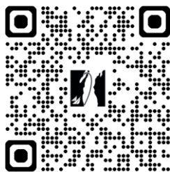
North Sails Weather Brief